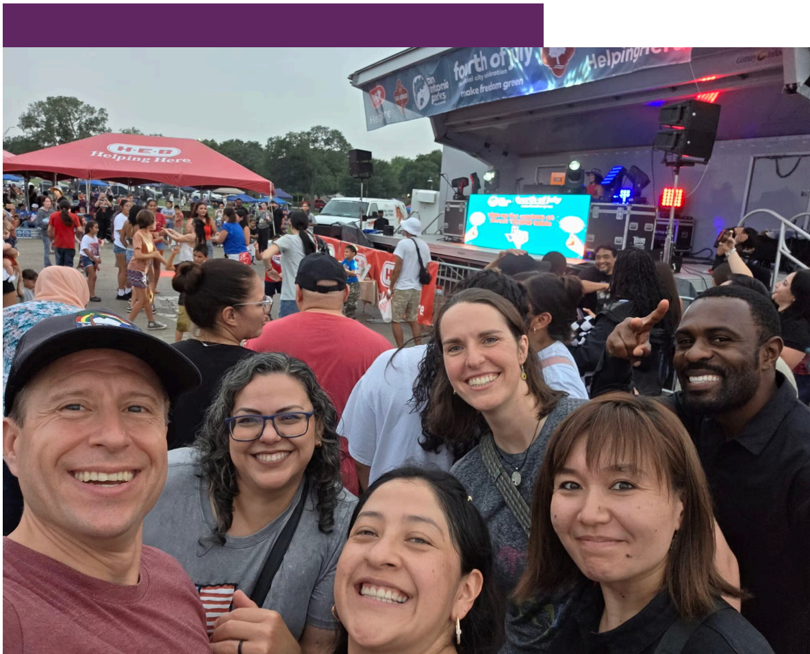
Exchange participants celebrating the U.S. Independence Day together on the 4th of July in San Antonio, Texas