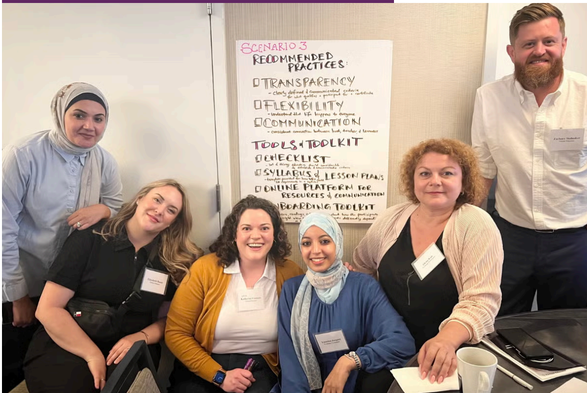
Virtual Educators and host coordinators participating in the professional development workshops

One of the most valuable moments of the exchange was a panel discussion with Regional English Language Officers (RELOs). RELOs based in Kyiv, Manila, Brasilia, and Washington, D.C. shared how Virtual Educator projects have made an impact across their regions and how these initiatives connect to broader diplomatic goals. Participants heard candid reflections on both the challenges of launching and sustaining programs and the innovative ways RELOs work to build strong partnerships and long-term success.