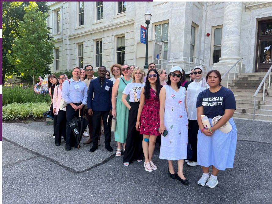
Exchange participants pose for a group picture in front of American University