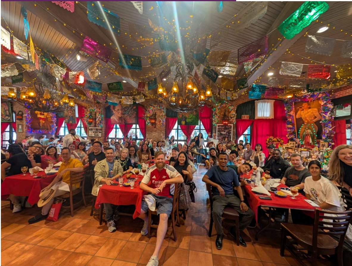
Exchange participants enjoying a restaurant together on the 4th of July