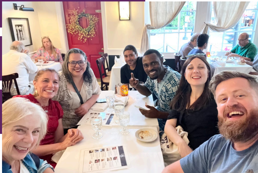
Virtual Educators, host coordinators, and staff sharing dinner at a restaurant